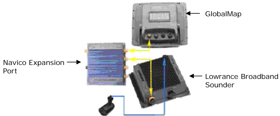
GlobalMap unit and Lowrance Broadband Sounder connected to Navico Expansion Port using Ethernet extension cables.