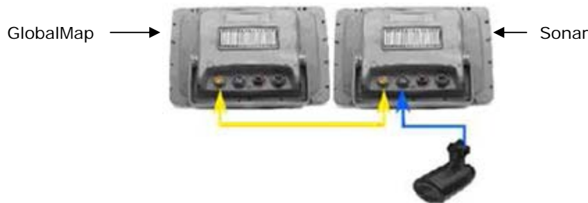
GlobalMap connected to Sonar unit using Ethernet.

When a GlobalMap unit senses sonar data on the Ethernet network, it will be able to display full-scrolling sonar as well as sonar functions. The GlobalMap unit will display all the Sonar Pages, controls, and features like a sonar unit. The Ethernet sonar data can come from a Lowrance sonar unit or a Lowrance Broadband Sounder.