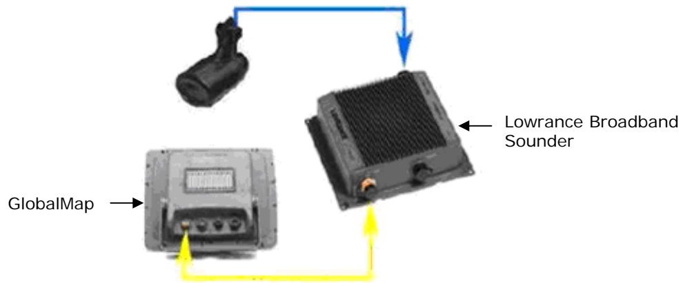
GlobalMap unit connected to Lowrance Broadband Sounder using an Ethernet extension cable.